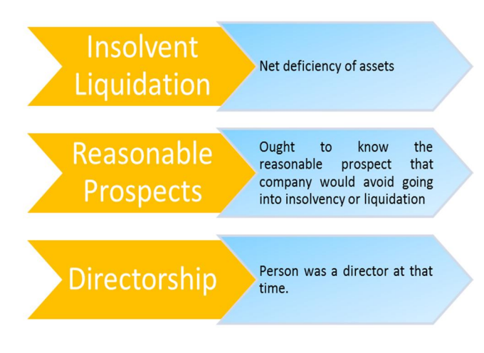
Figure 21: Ingredients of Wrongful Trading

The Liquidator has to establish the following-